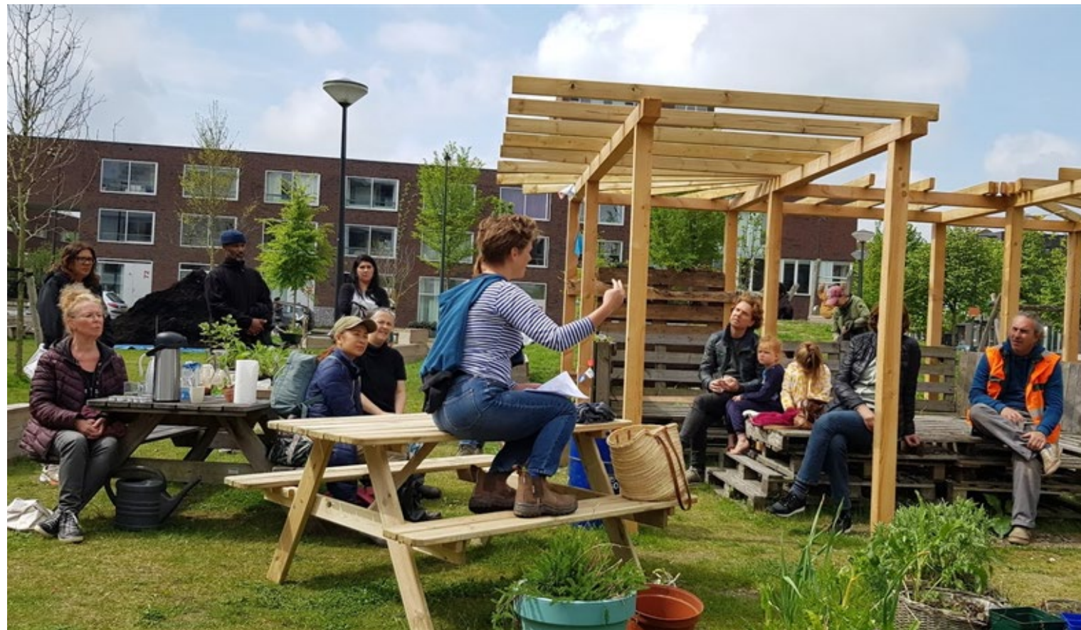
Buurtrechten - Gemeente Amsterdam